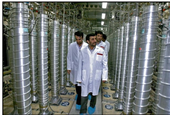
Figure 7: Iranian President Mahmoud Ahmadinejad Visits the Natanz Uranium Enrichment Facilities

2. PPT 16 Nuclear fuel-making plants: Enriched uranium, chemically separated plutonium from spent reactor fuel, or facilities that processed or fabricated these materials were determined by the report to bring a state to the very brink of bomb making.