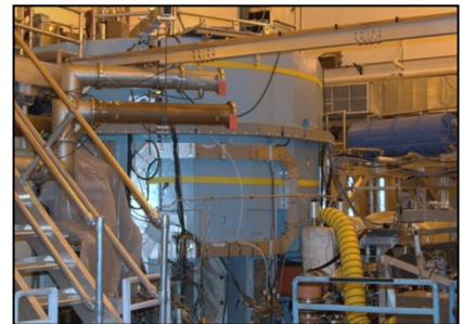
Figure 11: MIT Fusion Reactor

1. PPT 20 Small research reactors producing isotopes for medical, agricultural, and industrial purposes: These reactors could be built so they could not make a bomb's worth of plutonium except over a very long period of time, e.g., a decade or more. Periodic inspections could easily spot a diversion well before any bomb could be built.