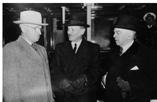
Figure 3: Harry Truman, Clement

A nation or even a political group, given the opportunity to start aggression by a sudden use of nuclear destruction devices will be able to unleash a 'blitzkrieg' infinitely more terrifying than that of 1939–40. A sudden blow of this kind might literally wipe out even the largest nation—or at least all of its production centers—and decide the issue on the first day of the war. If two people are in a room of 100 by 100 feet and have no weapons except their bare fists, the attacker has only a slight advantage over his opponent. But if each of them has a machine gun in his hand the attacker is sure to be victorious...with the production of nuclear bombs...the world situation approaches that of two men with machine guns in a 100 by 100 foot room. 7