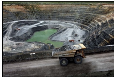
Figure 6: Uranium Mining

1. PPT 15 Uranium mining: In 1946, uranium was assumed to be extremely scarce. Because of this, the mining or processing of uranium ore was assumed to be an activity that would be easy to control. Since no nuclear activity, peaceful or martial, would be possible without access to this ore, the panel recommended international ownership and control of uranium mining. Any country found mining its own uranium would immediately be found in violation of the proposed control regime.