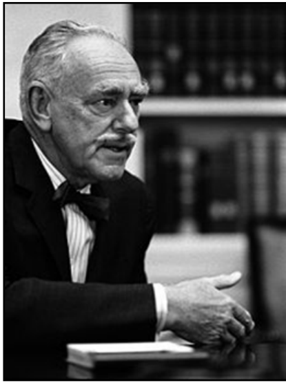
Figure 4: Dean Acheson

review of how to go about international control of nuclear energy. This effort is known by its most prominent report panelists: Dean Acheson, then-Undersecretary of State, serving as the panel's chairman and who later became Secretary of State, and David Lilienthal, chairman of the Tennessee Valley Authority—the entity that supplied electricity to the Manhattan Project. 8 PPT 11 The key author of this review was J. Robert Oppenheimer, the guiding scientific light of the Manhattan Project and the laboratory of Los Alamos. PPT 12