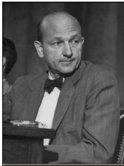
Figure 5: David E. Lilienthal

The assumption that the aggressor will always win featured prominently in this review as did the notion that city centers were the primary target. Early in the Acheson-Lilienthal Report, it is argued that nuclear weapons were revolutionary, “particularly as weapons of strategic bombardment aimed at the destruction of enemy cities and the eradication of their populations.” It also asserted that “there can be no adequate military defense against atomic weapons.” Finally, the report asserted that the uncontrolled development of nuclear energy “would not only intensify the ferocity of warfare, but might directly contribute to the outbreak of war.” 9