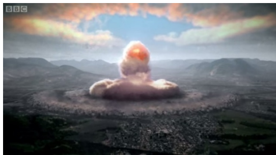
Figure 1: Bombing of Hiroshima

The first attempt at international control of nuclear energy was developed by the Acheson-Lilienthal Report and was formally delivered to the UN General Assembly in 1946 by Bernard Baruch in what is now known as the Baruch Plan.