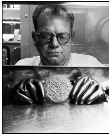
Figure 8: Worker Handling Plutonium

3. PPT 17 Nuclear weapons explosive materials: These could be used directly to make nuclear weapons cores, i.e., plutonium and highly enriched uranium.