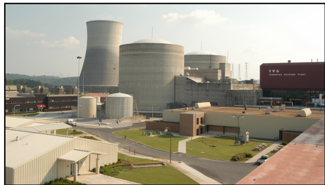
Figure 13: Sequoyah, Units 1 & 2

What the report referred as “denaturants” included the normal build-up of plutonium isotopes 240 and 242 in reactors optimized (run long enough) to produce the most economic amounts of electricity, as distinct from military production reactors optimized to produce plutonium 239 and 241 by