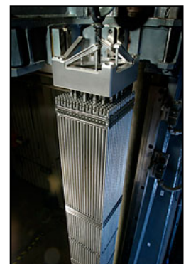
Figure 12: Nuclear Fuel Assembly

2. PPT 21 "Denatured" nuclear materials, e.g., low enriched uranium and natural uranium: These materials cannot be used to make bombs unless they were "enriched" with gaseous diffusion enrichment plants. These plants, though, would take at least a year to build and would take nearly an additional year of operation to produce their first gram of weapons-grade uranium. As a practical matter, these plants, their operation, and their construction could not be hidden. So while uranium mining and enrichment were dangerous activities, uranium and low enriched uranium themselves were considered to be safe materials.