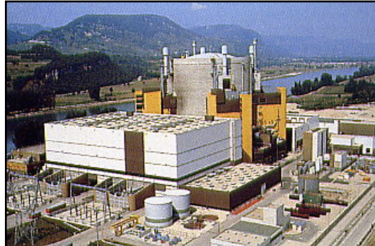
Figure 9: Super Phenix, Breeder Reactor, France

4. PPT 18 Reactors optimized to make plutonium: Graphite or heavy water moderated production reactors or fast reactors can easily be optimized to make plutonium for bombs.