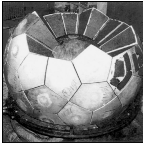
Figure 10: Explosive Lenses Arranged in Soccer Ball Shape

5. PPT 19 Nuclear weapons research and development related activities: Both are obviously dangerous nuclear activities.